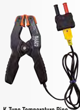
K-Type Temperature Pipe Clamp with Adapter 69140

Thermocouples are NOT intended for use on people or animals.