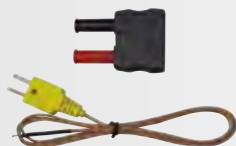
K-Type High Temperature Thermocoupler with Adapter 69142