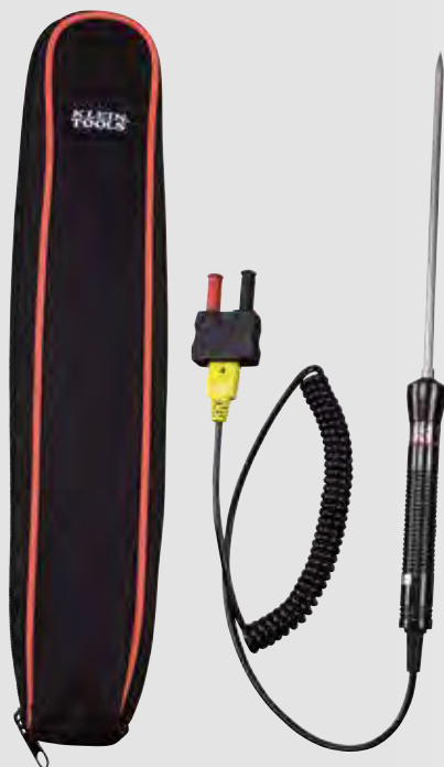
K-Type Temperature Probe with Adapter and Case 69144