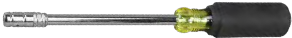
Extended Reach 65129 1/4" 5/16"